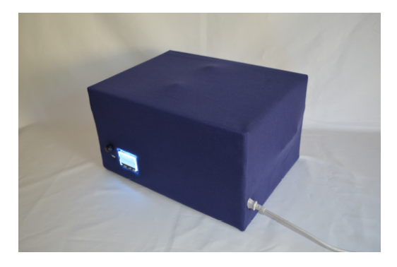
Figure 1: Tala Box final design

The Tala Box is a wooden enclosure totally covered by a piece of fabric (see Figure 1) designed to be used in medical environments where the user is therefore a person considered at risk, which calls for specific requirements. In particular, COVID-19 new standards have been taken into account when building the prototype. We chose a removable flexible top based on a semi-synthetic fabric coated with a natural elastomere so that it can be easily disinfected after each session. Wood is a material that is easy to manipulate and repair; in addition, its rigidity helps avoiding spurious resonances, which is important given that the Tala Box sound module is enclosed within. The choice of a uniform blue color is motivated by its soothing appeal and lack of distinctly visible features, thus possibly helping patients to project their own memories during sessions.