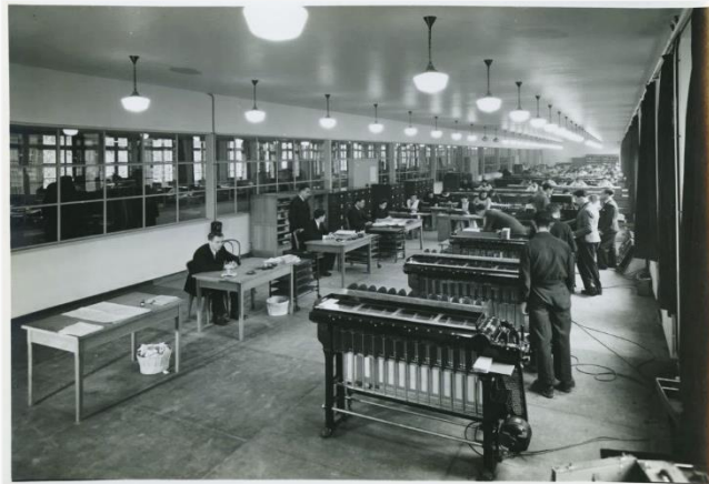
Figure 1 - Accounting and Mechanical data processing room at the BNCI's custodian Center for the securities in Dinan (France), in 1939

to free themselves from secretarial work, accounting and filing”. Such development seems linked to technological innovations in the field of mechanographical equipment: as the administrative work required the management of several tons of paper documents every month, the BNCI sought a way to automate operational tasks pertaining to data entry and statistical calculations. Punched cards were used by data entry operators to enter the positions of accounts and cheques, etc., the advantage