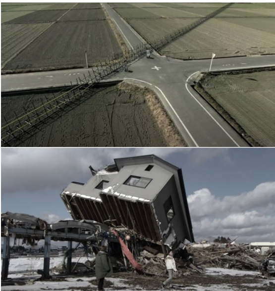
Screenshots from film trailer , images subject to copyright.