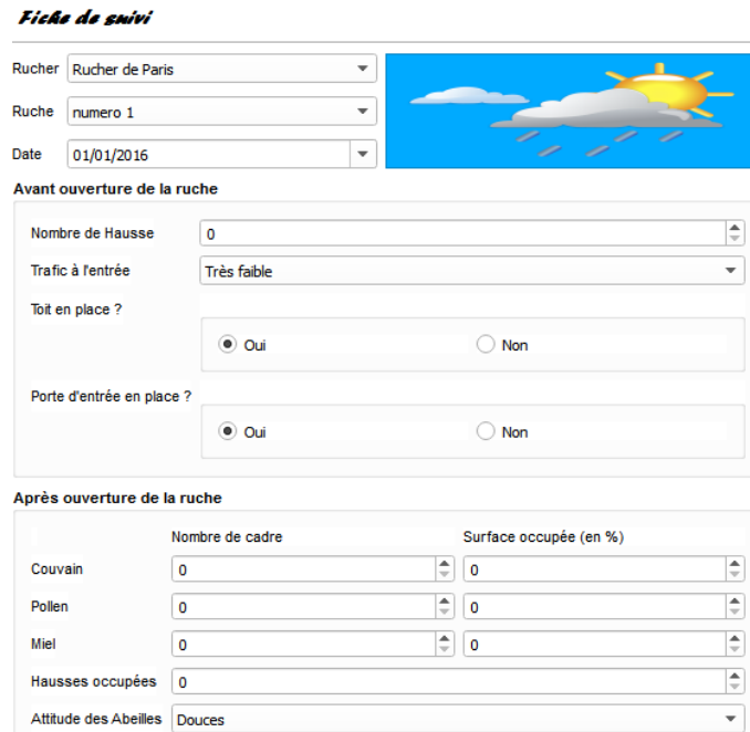
Fig. 3. Screenshot of the ApiSoft application: interface to collect data for beehives