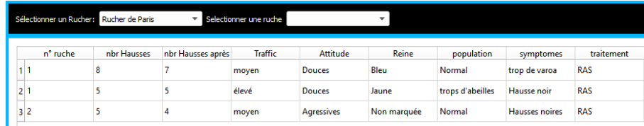
Fig. 4. Screenshot of the ApiSoft application: list of data for beehives

The figure 4 shows the data for all the beehives ( ruche ) of an apiary ( Rucher ). Different data are shown like the Traffic, the attitude, if the queen ( Reine ) are marked, if the beekeeper saw some symptoms and if the beehive received a treatment ( Traitement ).