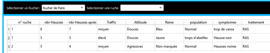
Fig. 4. Screenshot of the ApiSoft application: list of data for beehives

The figure 4 shows the data for all the beehives ( ruche ) of an apiary ( Rucher ). Different data are shown like the Traffic, the attitude, if the queen ( Reine ) are marked, if the beekeeper saw some symptoms and if the beehive received a treatment ( Traitement ).