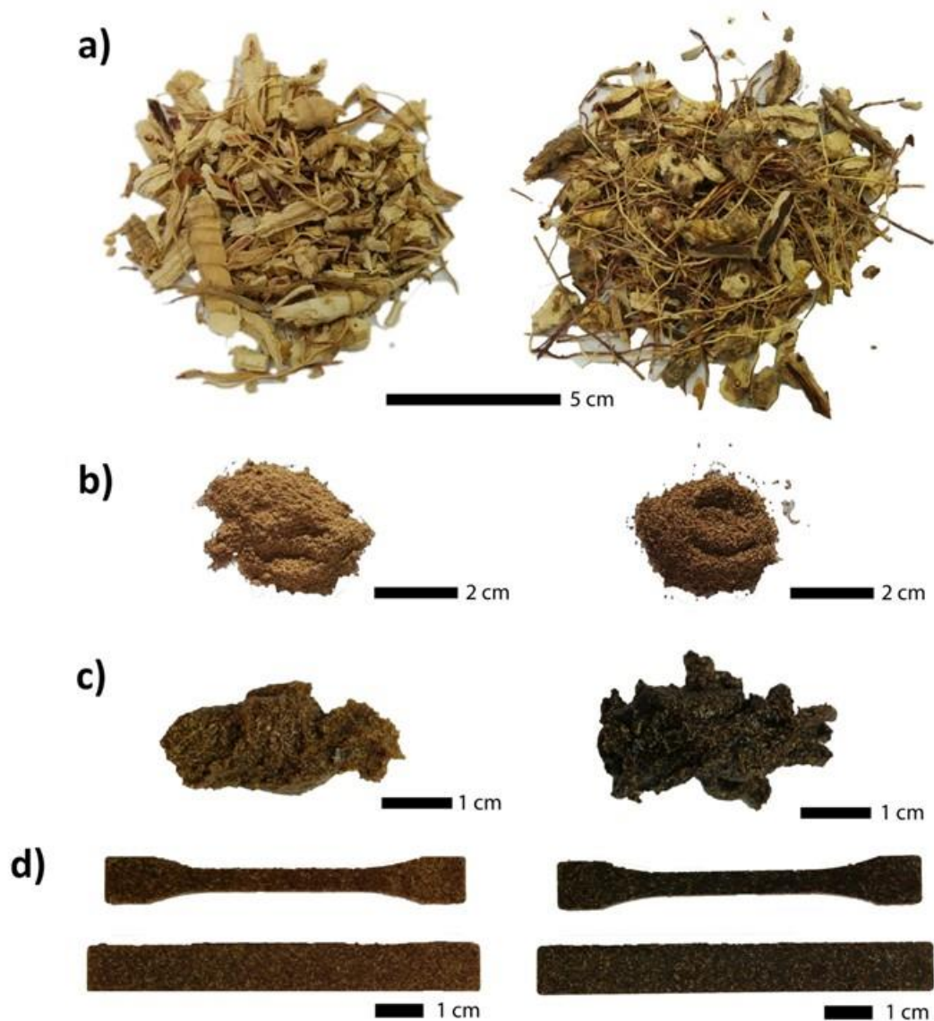
Figure 1. Physical aspect of GIG (left) and GOL (right) belowground materials a) before grinding, b) after sieving (fraction collected with 200-300 \mu\text{m} openings), c) after mixing in the internal mixer, and d) after injection molding.