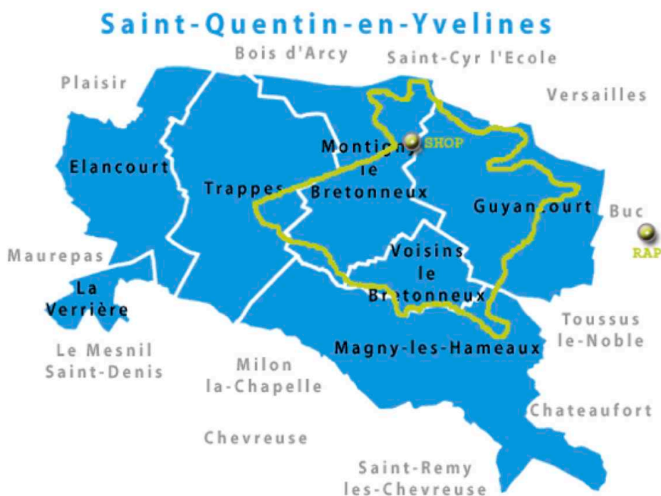
Figure 2: Twizy Way service area (marked by a green line).

By dividing responsibilities as such, Renault contributed to an urban planning policy dedicated to developing the infrastructure for electric car sharing (terminals and stations). However, during the negotiation process, Renault decided to reduce the perimeter of experimentation. The Saint-Quentin's officials refused to spend public money on the installation of charging terminals and closed stations on the public space.