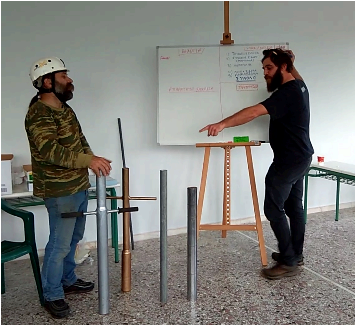
Picture 5: Presenting, explaining and recording key information to make the pole hammering tool at the Tzoumakers makerspace.

their tool . This 'ownership' became also evident at the end of the workshop, when a funny video was spontaneously made by one of the participants. The participant played a salesperson who praised the tool as if it was part of an advertising spot, saying for instance that «with this tool, I was saved! I fenced the whole village and now I can sleep peacefully». After the sales pitch, another participant underlined that the tool was produced by Tzoumakers, while another one added that it is a «clever tool». Even if this anecdote mobilises fiction and humour, it nonetheless reveals pride and a sense of achievement in a moment of collective enjoyment. This sense of community was also established on a more serious level by developing an ethics of contribution and reciprocity in the use of the tool. For example, while discussing about the lending process of the tool with anyone who might need it, regardless of whether he/she participated in the construction process, the idea of asking for a small donation in the form of makerspace consumables gained ground. In this way «free» as «free beer» is to be avoided while «free» as «free speech» empowered (Stallman, 2015 p.3).