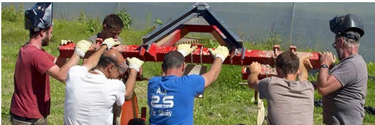
Picture 2: Construction of the quick hitch triangle.

Before continuing our story about the legume-harvesting machine, a few more details about L'Atelier Paysan are useful. L'Atelier Paysan is a cooperative that was created in 2014 and builds upon construction workshops that have been taking place since 2009. The methodology of L'Atelier Paysan consists of several practices: doing tours to make an inventory of peasant innovations; developing tools via testing, prototyping, upgrading and realizing workshops; and 'liberating' the collectively-validated tools via the publication of detailed plans and tutorials on the Internet. One of its most prominent tools is the quick hitch triangle (picture 2), which replaces the usual three-point linkage between a tractor and the tool to be fixed behind it. For the quick hitch triangle, L'Atelier Paysan has produced a 10-minute video, taken many pictures, issued a 47-page booklet, and drawn several plans – all of which are freely available on its webpage 6 . It is important to stress a key feature: it is not L'Atelier Paysan that develops new tools from scratch 'in house'; rather, they actively look out for farmers' innovations. Only thereafter, through collective construction work, after testing the tool in the field and various processes of representation (plans, pictures, videos), are the tools released. Put differently, while user innovations are already there, 'in the field', the role of L'Atelier Paysan is to collect, improve, formalize and disseminate these innovations.