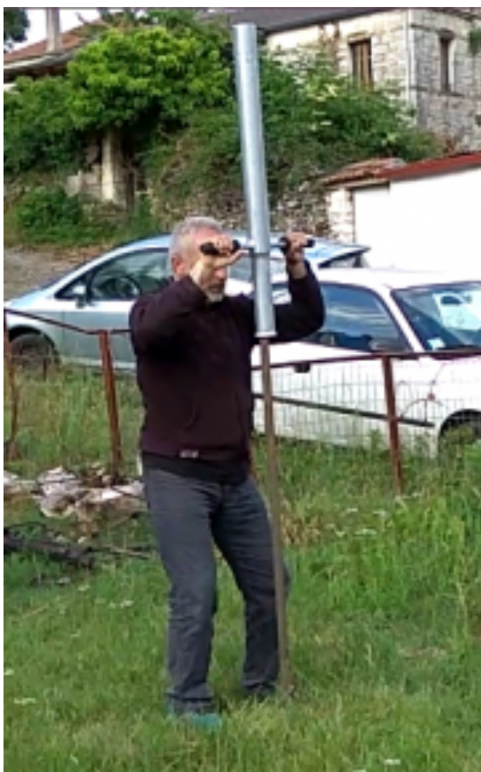
Picture 4: Testing the newly constructed tool for hammering fencing-poles from the Tzoumakers group.

A common concern for farmers of the broader region of Tzoumerka in Northern Greece is that animals, especially wild boards, often damage their crops by entering their fields, and eating and destroying their crops. As they try to avoid the high costs incurred by having specialized fencing technicians involved in such a task, they fence their land themselves. This