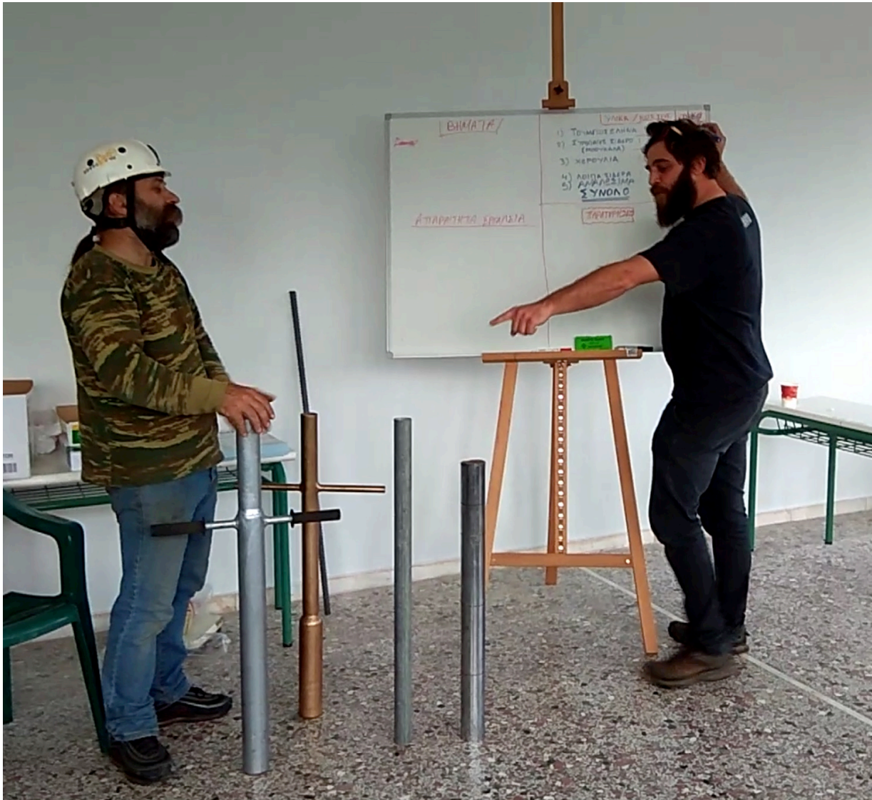
Picture 5: Presenting, explaining and recording key information to make the pole hammering tool at the Tzoumakers makerspace.

their tool . This 'ownership' became also evident at the end of the workshop, when a funny video was spontaneously made by one of the participants. The participant played a salesperson who praised the tool as if it was part of an advertising spot, saying for instance that «with this tool, I was saved! I fenced the whole village and now I can sleep peacefully». After the sales pitch, another participant underlined that the tool was produced by Tzoumakers, while another one added that it is a «clever tool». Even if this anecdote mobilises fiction and humour, it nonetheless reveals pride and a sense of achievement in a moment of collective enjoyment. This sense of community was also established on a more serious level by developing an ethics of contribution and reciprocity in the use of the tool. For example, while discussing about the lending process of the tool with anyone who might need it, regardless of whether he/she participated in the construction process, the idea of asking for a small donation in the form of makerspace consumables gained ground. In this way «free» as «free beer» is to be avoided while «free» as «free speech» empowered (Stallman, 2015 p.3).