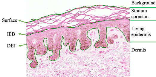
Fig. 1: Histological image of lesional human skin (with high DEJ structural deformations) showing its main compartments and corresponding boundaries.