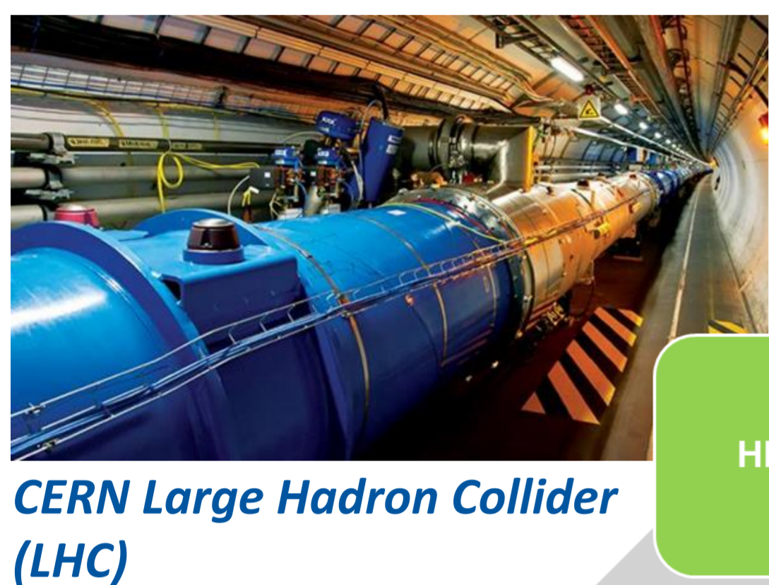
CERN Large Hadron Collider (LHC)