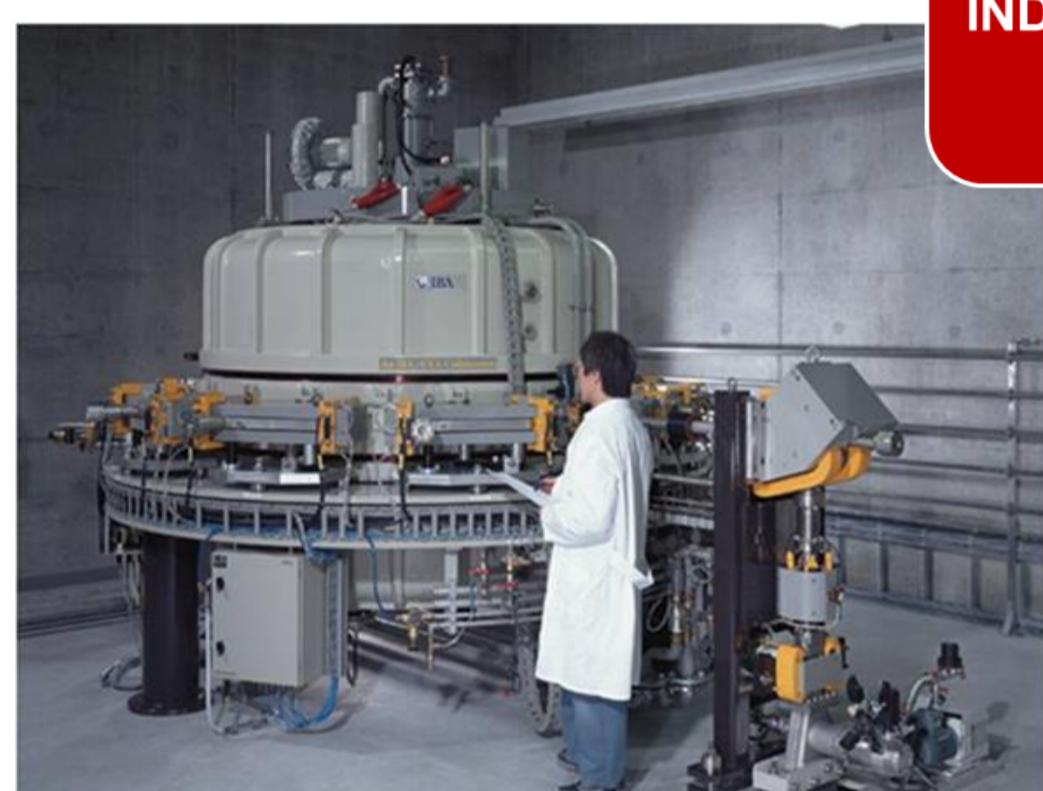
10 MeV IBA rhodotron