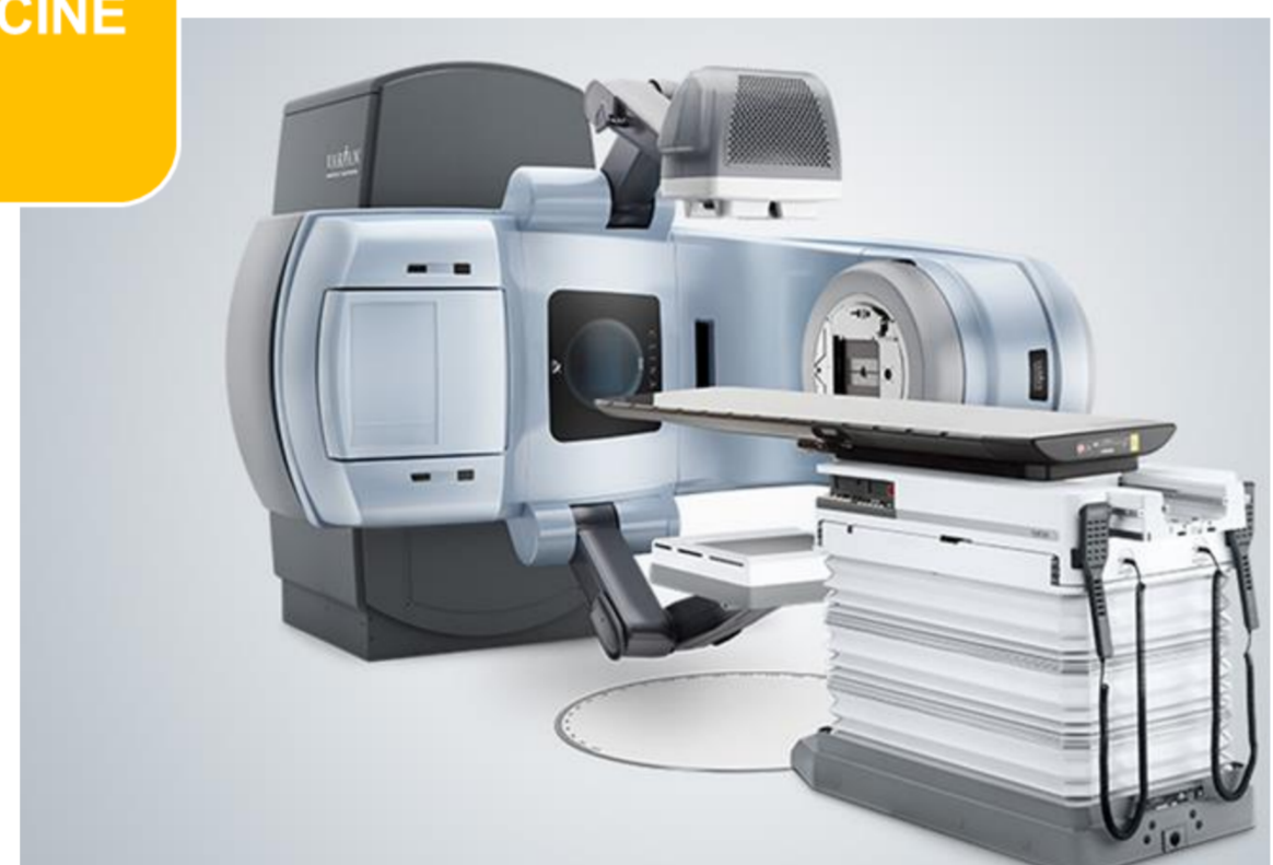
Clinac® iX System linear accelerator