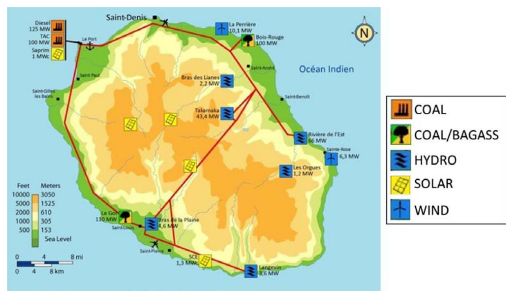
Figure 1. The Reunion power system as operated in 2008

As for all French Non Interconnected Zone (ZNI) to the continental transport network, the maximum share of intermittent generation is legally limited to 30% within the island's electricity grid, due to reliability reasons. The reliability of supply is defined as the ability of the power system to lock back into steady-state conditions after sudden disturbances (e.g. load or production fluctuations). Indeed, the major drawback of the supply of electricity based on renewable energy is that the production of electricity varies highly according to the availability of the resource (wind, solar, wave, etc.). This causes a real problem for non-interconnected electrical grid where intermittent renewable energies should be limited to a maximum level. Note that this question of reliability is also considered in other modelling exercises done for islands ambitioning to integrate larger shares of renewables, as it is the case for Cyprus reaching a share of 30% of intermittent sources to generate electricity of the island (Taliotis et al., 2017a,b). In the case of Reunion Island, this limitation is imposed by Electricity of France (through the Decrees of March 13, 2003, Article 15, and April 23, 2008) based on its capacity to keep the reliability of the network. This aspect is of tremendous importance, especially when high shares of renewable energy sources, and in particular intermittent energy sources, are expected to be integrated in electricity production.