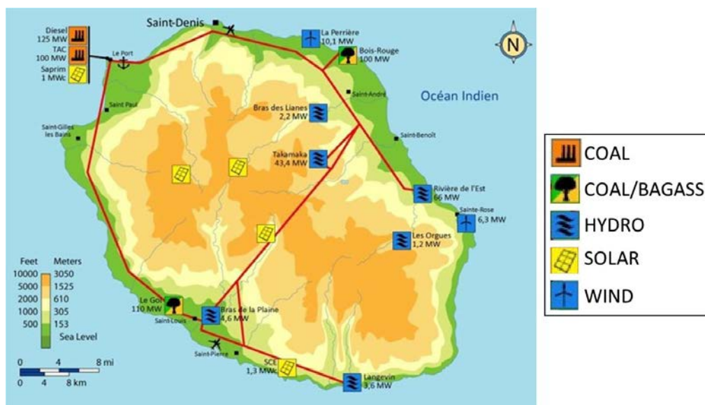
Figure 1. The Reunion power system as operated in 2008

As for all French Non Interconnected Zone (ZNI) to the continental transport network, the maximum share of intermittent generation is legally limited to 30% within the island's electricity grid, due to reliability reasons. The reliability of supply is defined as the ability of the power system to lock back into steady-state conditions after sudden disturbances (e.g. load or production fluctuations). Indeed, the major drawback of the supply of electricity based on renewable energy is that the production of electricity varies highly according to the availability of the resource (wind, solar, wave, etc.). This causes a real problem for non-interconnected electrical grid where intermittent renewable energies should be limited to a maximum level. Note that this question of reliability is also considered in other modelling exercises done for islands ambitioning to integrate larger shares of renewables, as it is the case for Cyprus reaching a share of 30% of intermittent sources to generate electricity of the island (Taliotis et al., 2017a,b). In the case of Reunion Island, this limitation is imposed by Electricity of France (through the Decrees of March 13, 2003, Article 15, and April 23, 2008) based on its capacity to keep the reliability of the network. This aspect is of tremendous importance, especially when high shares of renewable energy sources, and in particular intermittent energy sources, are expected to be integrated in electricity production.