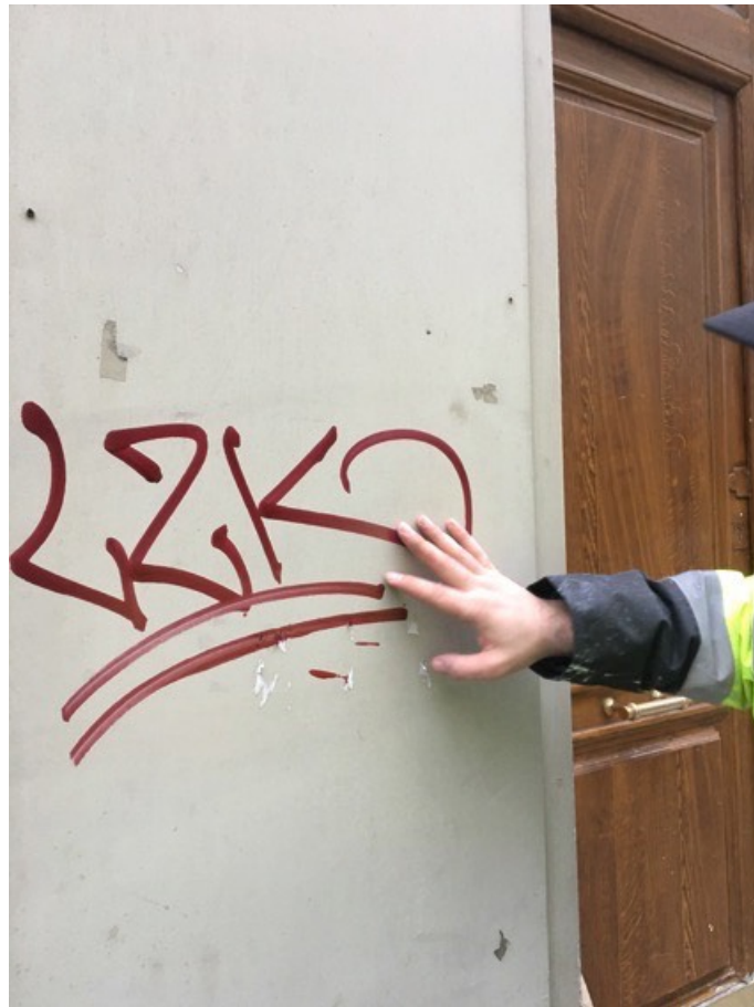
Figure 4. Touching the wall and the graffiti

But the material enactment of walls is not done only by a visual and tactile evaluation. It also goes through the workers' corporeal postures and their bodily adjustments during the removal intervention. The use of high pressure water, for instance, requires the right distance. Workers need to tune their gestures with a series of meticulous trials and errors during the first seconds of the operation that allows them to gently erase the inscriptions without deteriorating the wall that bears it. Likewise, applying chemicals require a careful use of sponges and rags. It is of critical importance to deploy them in the right space and at the right time. If the product is let for too long on the wall, it would irremediably damage the wall and prevent any 'normal' state to be restored.