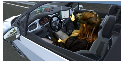
Figure 1: Illustration of a user with HMD immersed in the Virtual Learning Environment

Permission to make digital or hard copies of part or all of this work for personal or classroom use is granted without fee provided that copies are not made or distributed for profit or commercial advantage and that copies bear this notice and the full citation on the first page. Copyrights for third-party components of this work must be honored. For all other uses, contact the owner/author(s). VAM-HRI'2018, March 2018, Chicago, Illinois USA © 2018 Copyright held by the owner/author(s). ACM ISBN 978-x-xxxx-xxxx-x/YY/MM. https://doi.org/10.1145/nnnnnnn.nnnnnnn