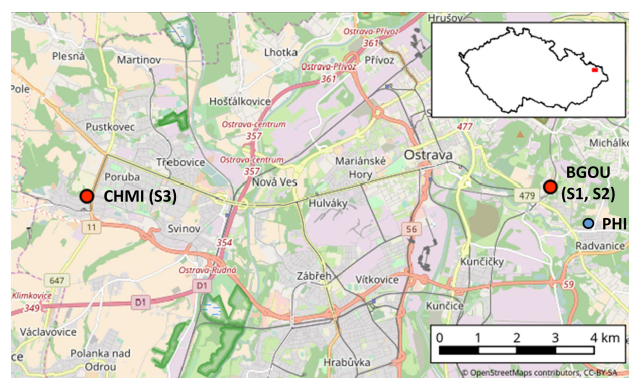
Figure 1. Locations of the measuring stations. CHMI: Czech Hydrometeorological Institute area (station S3); BGOU: Botanical Garden of the University of Ostrava (stations S1 and S2); PHI: measuring station of the Public Health Institute of Ostrava. Map data copyrighted OpenStreetMap contributors.

Several meteorological variables (air temperature, relative air humidity, air pressure, wind speed, and wind direction) and concentrations of air pollutants (PM 10 , NO, NO 2 , NO x , and SO 2 ) were measured at the measuring station owned by the Public Health Institute of Ostrava (PHI). The PHI has a