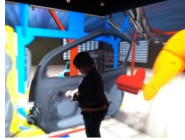
Fig. 5. Human Robot Copresence Study. Virtual Environment.