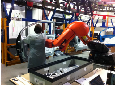
Fig. 4. Human Robot Copresence Study. Real Environment.