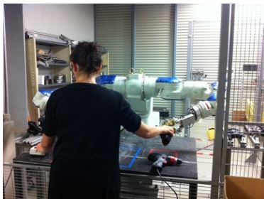
Fig. 6. Human Robot Cooperation Study. Real Environment.