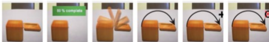
Fig. 3. Study of gesture feedback : on a box opening task, the gesture is measured and several visual feedbacks are proposed to the user (from left to right : boolean, textual, steps, normal, enhanced, openloop) and compared in terms of gesture completion and proximity to an initially recorded natural gesture

We compared descriptors of gestures between an initially recorded natural gesture (done with no feedback constraints), and the gestures performed with the feedbacks. Results showed firstly that the non coupled feedback is immediately recognized as such, and gesture descriptors greatly differ from initial gesture (small movements, shorter time). Mechanical work and completion time are also different for all feedbacks. Finally the subjective preferences of users went to enhanced feedback, and diminish with for lower levels of information. In a second experiment, we studied the role of affordances on gesture memorization. We have shown that affordances, which is the visual appearance of objects that shows how it is operated, increase user recall of gestures.