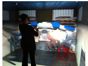
Fig. 7. Human Robot Cooperation Study. Virtual Environment

between real and virtual environments. A increase in heart rate was found when the robot was close, in both real and virtual conditions. Finally, a skin conductance raise (that may be representative of user stress) when the robot was close, in the real conditions, was not found in the virtual condition. In the cooperation scenario, the main result is again that the questionnaires get close responses between real and virtual conditions (acceptability, perceived security, usability). And we observe the same trends on physiological measures as for the copresence use case. We can hypothesize that more complete feedbacks (such as haptics providing contact information with the environment, or auditory feedback for factory or simulated robot sounds) may increase ecological validity, but these require specific studies.