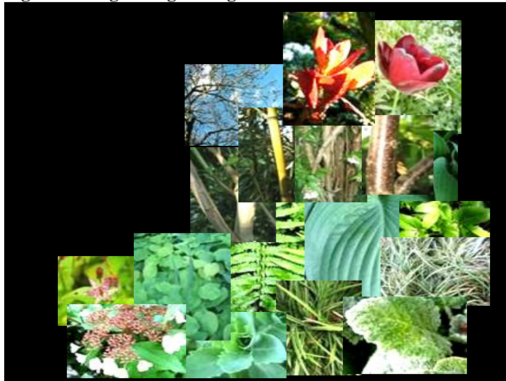
Figure 2 - Organizing a "Vegetal Palette" for the artist