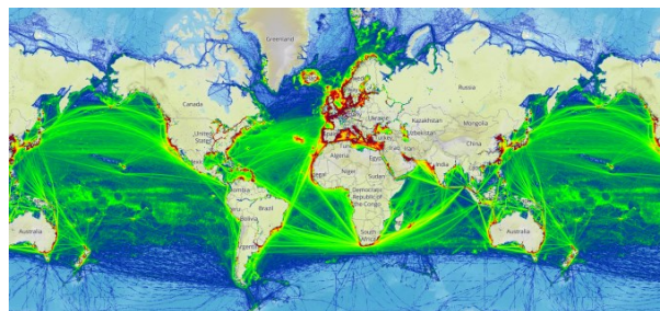
Figure 1: Worldwide AIS Traffic Data in 2015 (marine traffic)

In this article, we present a method for the assessment of the quality of AIS messages and the evaluation of geospatial risks associated. In section 2, the AIS is presented along with its geospatial nature and its weaknesses. Then section 3 presents the method for genuineness assessment of the message. Next, section 4 focuses on the spatiality of risks associated with AIS falsification, followed by a conclusion.