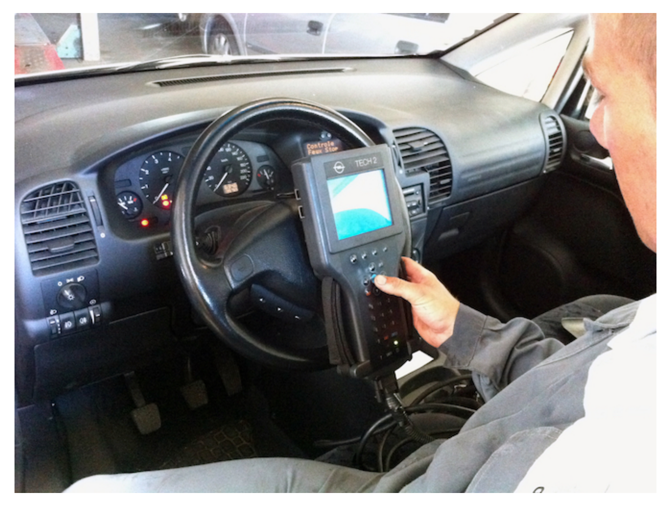
Figure 1: Professional repair

Following Edgerton (2006), we can use the case of the automobile to understand the differences in the ways maintenance can be distributed. In countries of the global North, cars are more and more crammed with electronics, which imply that their maintenance is a highly technical matter that can only be handled by specialized and well-equipped workers, leaving aside most of their mundane users (figure 1). In many Southern countries in contrast, second hand cars are known to live a long and rich life, sustained by continuous repair operations carried out by people way beyond the walls and benches of approved workshops.