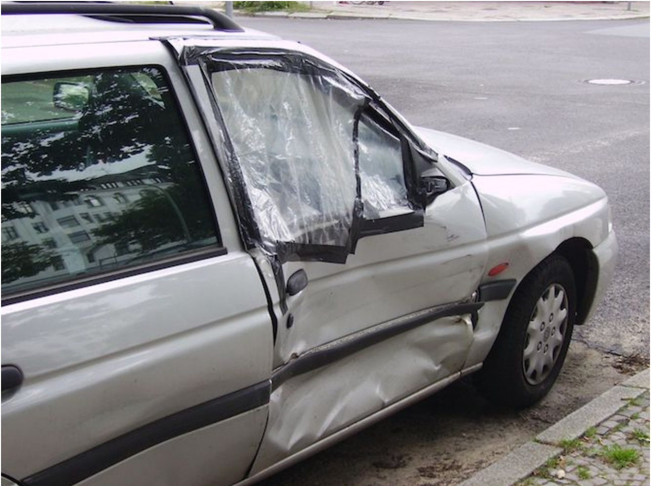
Figure 2: A “functional” car - photo by Garitzko