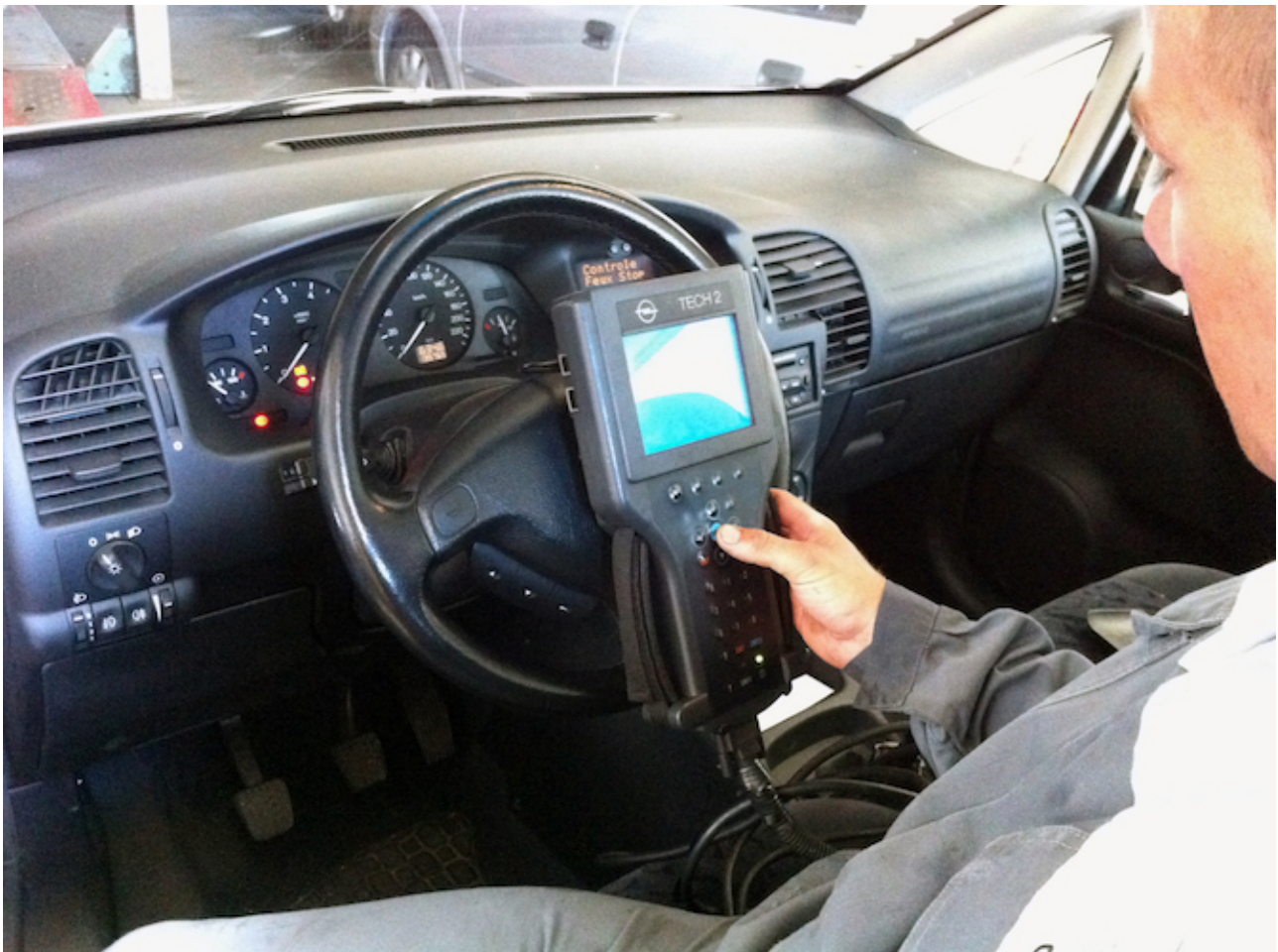
Figure 1: Professional repair

Following Edgerton (2006), we can use the case of the automobile to understand the differences in the ways maintenance can be distributed. In countries of the global North, cars are more and more crammed with electronics, which imply that their maintenance is a highly technical matter that can only be handled by specialized and well-equipped workers, leaving aside most of their mundane users (figure 1). In many Southern countries in contrast, second hand cars are known to live a long and rich life, sustained by continuous repair operations carried out by people way beyond the walls and benches of approved workshops.