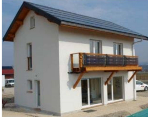
Figure 2: One of the INCAs House, in Chambéry [10]

This model has been tested on a case study. A family house has been chosen, situated on the Incas platform, near Chambéry [10]. It was built to respect the passive house standard. The heated floor area is 90m 2 .