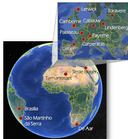
Fig. 1. Locations of the fourteen BSRN stations used for the quality assessment of HC3v4, HC3v5 and MACC-RAD

The Baseline Surface Radiation Network (BSRN) is a collection of measurements of GHI, diffuse irradiances on horizontal surface, and DNI of high quality suitable for validation [10][11][12]. Measurements are acquired every 1 min. Figure 1 and table 1 give the locations and the main characteristics of the fourteen BSRN stations used for the quality assessment of the data, located in the MSG coverage.