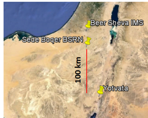
Figure 1. Map of the three stations. The red line is 100 km in length.

Measurements of the global G and diffuse D SSI and of the beam irradiation received at normal incidence B_N were collected from three stations (Fig. 1 and Table 1) from the Israel Meteorological Service (IMS), the BSRN network and an undisclosed company for the period 2006–2011. The direct SSI B on horizontal surface is computed from the difference G-D . Measurements are integrated over 10 min at Beer Sheva and Yotvata and 1 min at Sede Boqer which belongs to the BSRN network. 1 min measurements at Sede Boqer were averaged over 10 min to match the sampling rate of the two other stations. The solar zenith angle \theta_s corresponding to each measurement is computed with the SG2 al-