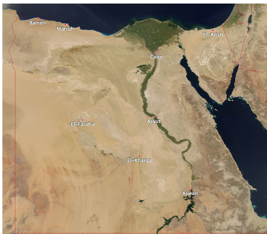
Figure 1. Location of the eight surface stations of the Egyptian Meteorological Authority (EMA) whose data are included in the SUSIE database.