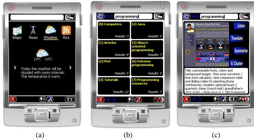
Fig. 2. (a) VipAccess Mobile interface. (b) VipAccess Mobile with clusters. (c) VipAccess Mobile for summarization.

different visualizations which try to make the most of both techniques i.e. lists of web page results and lists of clusters of web pages results.