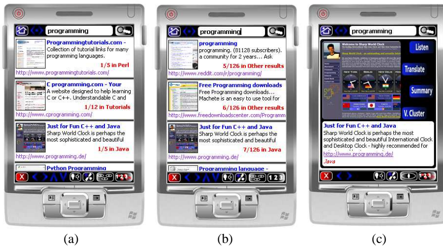
Fig. 3. (a) Clustering visualization. (b) List visualization. (c) Full-screen visualization.

In order to take into account that the users of mobile devices may use their device in different contexts, such as car, classroom or street, we also propose a full-screen visualization (Figure 3c). In this case, the best first web page result of the most relevant cluster is presented to the user. The next result is obviously the best first web page result of the second most relevant cluster, and so on and so forth.