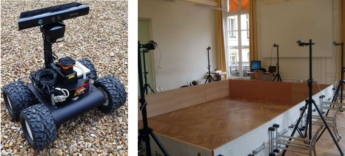
Fig. 1. The Wifibot Lab v4 Robot (left); Experiment area with motion-capture system (right)

The wheeled robot used for our experiments is shown on the left of Figure 1. The robot is equipped with an Intel Core i5-based single-board computer running Ubuntu Linux, WLAN 802.11g wireless networking, all-wheel drive via 12 V brushless DC motors, and a Kinect camera providing 3-D point cloud scans of the environment. The