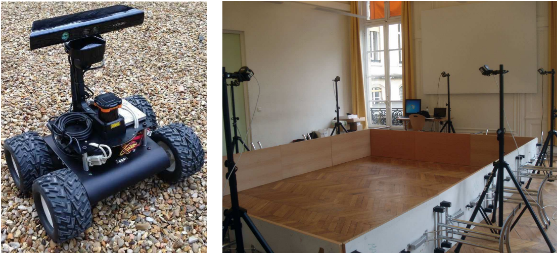
Fig. 1. The Wifibot Lab v4 Robot (left); Experiment area with motion-capture system (right)

The wheeled robot used for our experiments is shown on the left of Figure 1. The robot is equipped with an Intel Core i5-based single-board computer running Ubuntu Linux, WLAN 802.11g wireless networking, all-wheel drive via 12 V brushless DC motors, and a Kinect camera providing 3-D point cloud scans of the environment. The