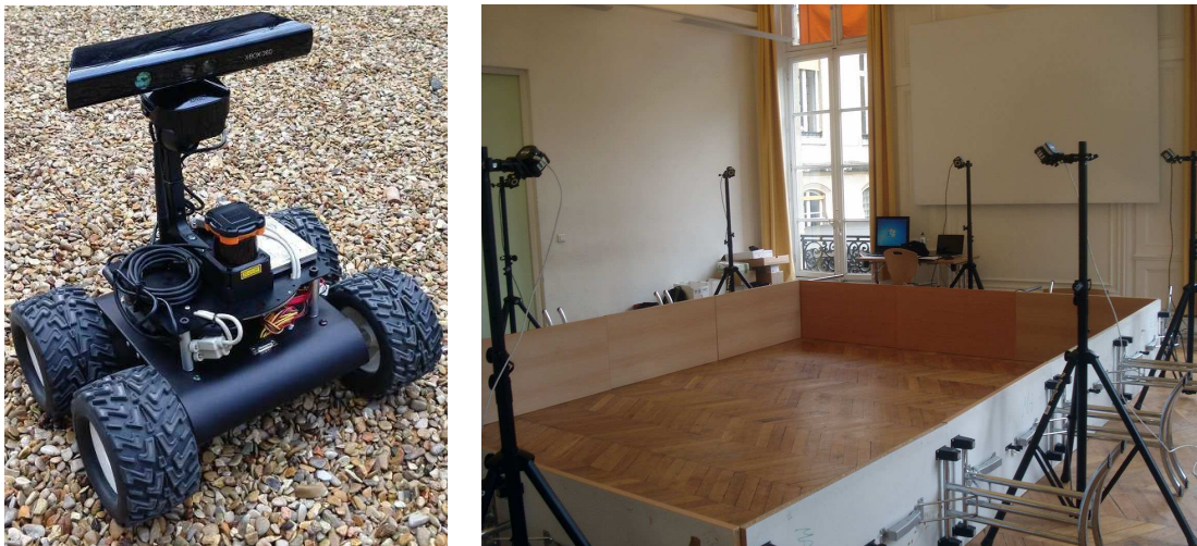
Fig. 1. The Wifibot Lab v4 Robot (left); Experiment area with motion-capture system (right)

The wheeled robot used for our experiments is shown on the left of Figure 1. The robot is equipped with an Intel Core i5-based single-board computer running Ubuntu Linux, WLAN 802.11g wireless networking, all-wheel drive via 12 V brushless DC motors, and a Kinect camera providing 3-D point cloud scans of the environment. The