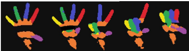
Figure 2. Example of the Random Decision Forest output for pixelwise classification in the case of finger identification.

When using only 6 labels, we only identify the different fingers using a very small forest, encompassing a couple of trees with a depth of a semi dozen. The forest can be efficiently trained using less than a hundred of manually annotated images.