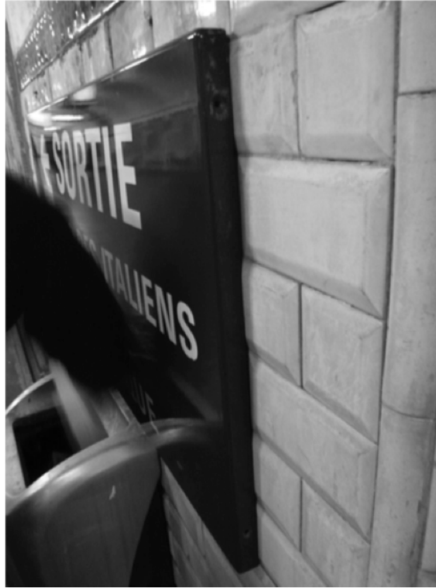
Figure 4. Shining the sign.

These two sequences show that reassemblage is more than a simple re-establishment of already-present elements. Much on the contrary, what our observation of repair sheds light on is that the boundaries between the signs and their environment are neither frozen in place nor sealed or closed. While the squares of newspaper were added to hold the PVC sheet in place in the first sequence, in the second, glue, extra screws, and, above all, metal brackets specially created for the task made it possible to reinforce the sign to the wall. During their interventions, the maintenance workers constantly consider different material sites, strengthen their composition according to their own criteria, and try to make them hold as a coherent assemblage as best they can. Instead of encountering objects with stabilized boundaries, such as a wall and a sign, they are immersed in a material flux made of multiple layers. In others words, they deal with a dense ecology of materials (Bennett 2004; Denis and Pontille 2015; Ingold 2007).