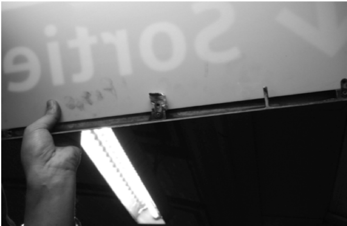
Figure 3. Fitting the sign into the lightbox.

This sequence reveals certain particularly interesting aspects of repair. First, it underlines a well-known dimension: the importance of improvisation and “bricolage” in the completion of repair and maintenance operations (Dant 2010; Henke 2000; Schubert in this volume). By