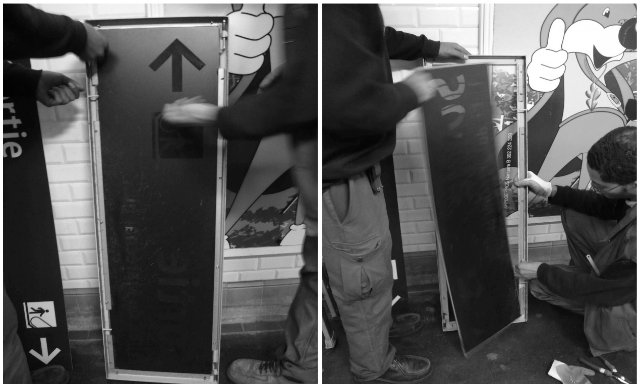
Figure 5. Removing screws.

The first step of the intervention consists in opening the lightbox in order to take its front side down. This is a delicate operation: perched on the top of a stepladder, Jonathan opens the box and puts his hands behind the frame, trying not to get burned by the fluorescent lamp and trying not to break the whole thing. Once the piece is detached and put on the floor, the next step is quite long. In order to take out the sheet itself, Brian and Jonathan have to remove manually all the sixteen small screws that hold the plaque to the metal frame (see figure 5). Once it's done, they put up the new plaque very carefully and screw back the frame. Finally, they put back the piece in front of the lightbox. After that, Jonathan tells us: “This makes no sense, 16 screws just to get at this sheet. All we'd need is a little trap along here and we could easily get the sign out without even having to open the box up, without needing to take anything out... But they don't think about that. They don't think about us.” (July 4th, 2007, Fieldnotes)