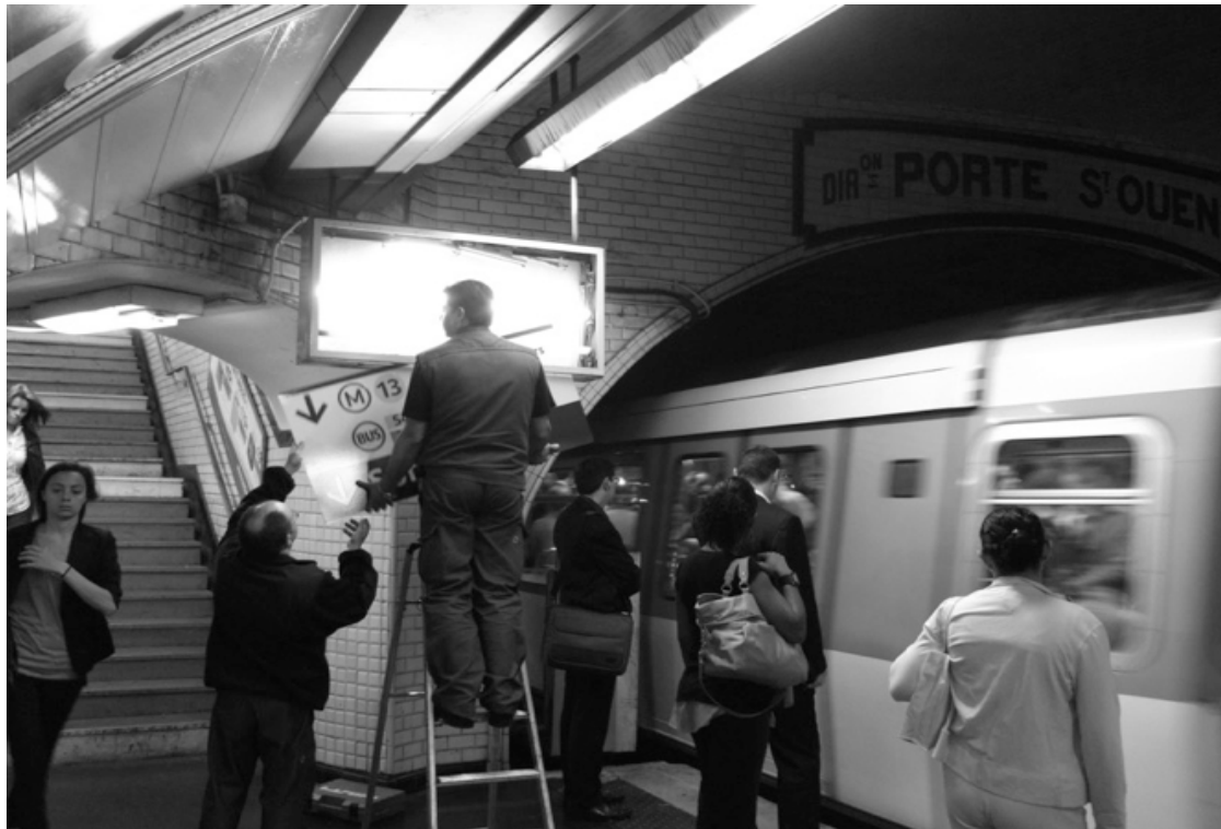
Figure 2. Sliding out the PVC sheet.