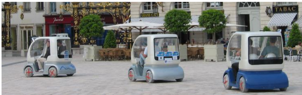
Figure 1 Cybercars cooperating in Nancy (France).

We focus on the decision making stage of the automated driving. We assume that perception and control