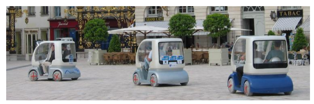
Figure 1 Cybercars cooperating in Nancy (France).

We focus on the decision making stage of the automated driving. We assume that perception and control