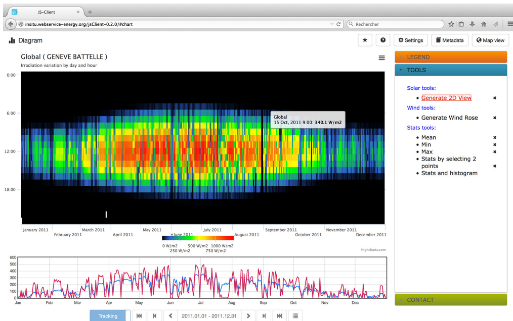
Fig. 2. Screenshot of additional features integrated into the web-based GUI

The newly created Sensor Web infrastructure will be integrated as a new component into the existing SDI known as the “Webservice-Energy.org GEOSS Community Portal dedicated to Energy and Environment”. This SDI developed and managed by MINES ParisTech since 2011 currently comprises a community portal, a catalog, and several client applications, data-models, maps and coverage data. It does not comprise in-situ observations yet. The catalog is CSW-compliant and may accommodate for in-situ measurements. It is connected to the GEOSS Common Infrastructure (GCI) † and is weekly harvested by the GEOSS DAB (Discovery and Access Broker). This allows all existing resources listed in the catalog to be available on the GEO Web Portal (GWP) for search and discovery rewarding efforts of data providers in their outreach and dissemination activities of their legacy data assets.