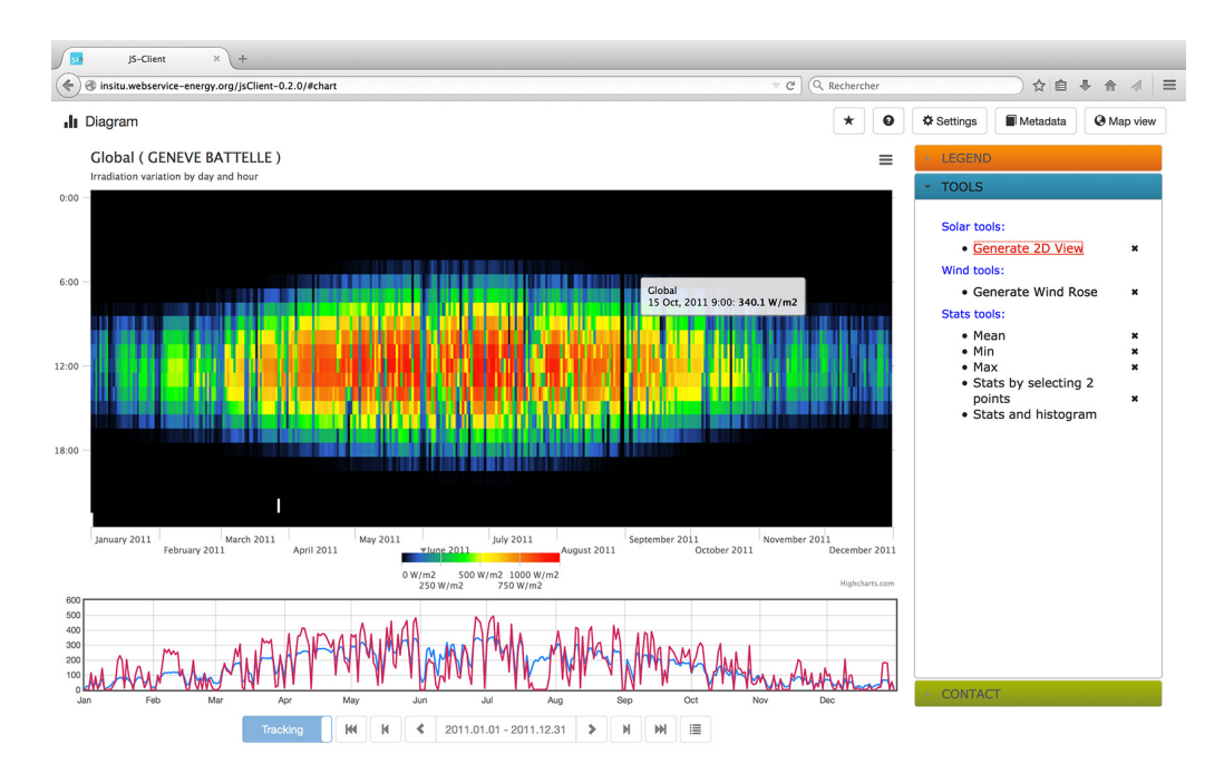
Fig. 2. Screenshot of additional features integrated into the web-based GUI

The newly created Sensor Web infrastructure will be integrated as a new component into the existing SDI known as the "Webservice-Energy.org GEOSS Community Portal dedicated to Energy and Environment". This SDI developed and managed by MINES ParisTech since 2011 currently comprises a community portal, a catalog, and several client applications, data-models, maps and coverage data. It does not comprise in-situ observations yet. The catalog is CSW-compliant and may accommodate for in-situ measurements. It is connected to the GEOSS Common Infrastructure (GCI)<sup>†</sup> and is weekly harvested by the GEOSS DAB (Discovery and Access Broker). This allows all existing resources listed in the catalog to be available on the GEO Web Portal (GWP) for search and discovery rewarding efforts of data providers in their outreach and dissemination activities of their legacy data assets.