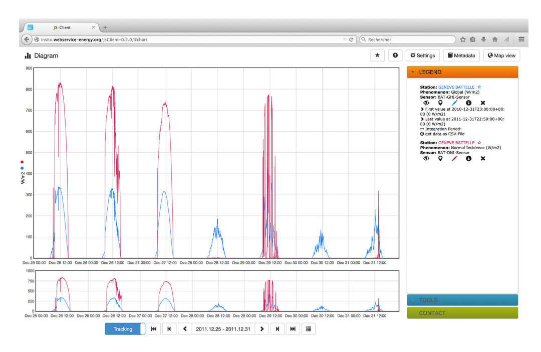
Fig. 1. Screenshot of the web-based GUI

End users should also have the possibility to get an easy access to in-situ measurements of SSI. A Web-based GUI, also called a thin client, will allow to: