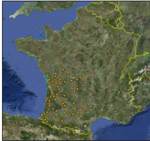
Fig. 1. Location of the 61 ground stations measuring GHI in the South-West quarter of France.

Météo France is the French meteorological network which consists in 3,811 meteorological ground stations located in the country, among which only 327 used to or still measuring GHI. It is also to be noted that only 7 of them measured in the past the direct component of the SSI and, presently, only one is still measuring it. The analysis presented below focuses on the South-West quarter of the country (130,132km 2 , 20% of the territory) whose irradiance level is suitable to PV project and where 61 ground stations measure this component ( cf. Fig 1).