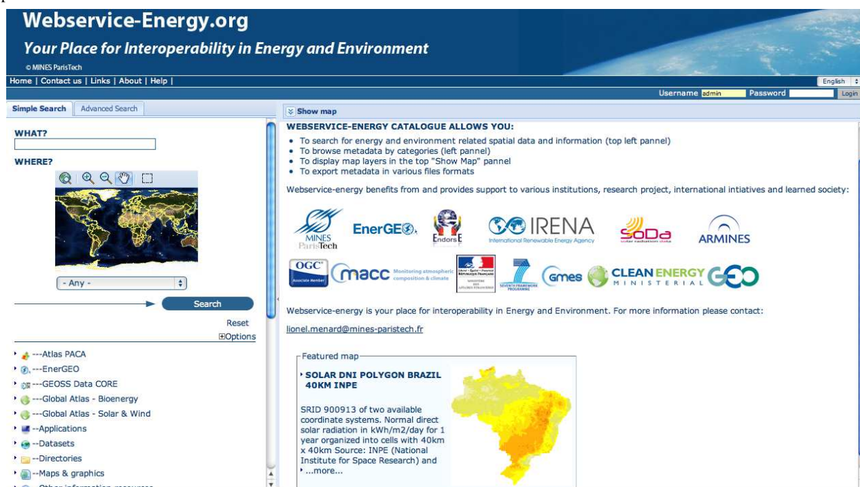
Figure 2 - Catalog OGC CSW

Data: The data component includes all relevant datasets in solar and wind energy with local, regional and global coverage. Whenever it is possible those datasets remain in their original location but the framework has also the possibility to host data from partners that do not have their own infrastructure.