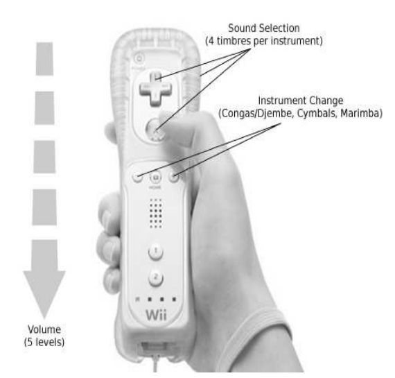
Figure 2. MAWii UI for sound generation (2 Wiimotes/patient)

Obviously, one of the great advantages of the Wiimote is that it can be used to control any synthesizable sound. Therefore, instead of having just one instrument each, we gave the children the possibility to have as many instruments as they would like.