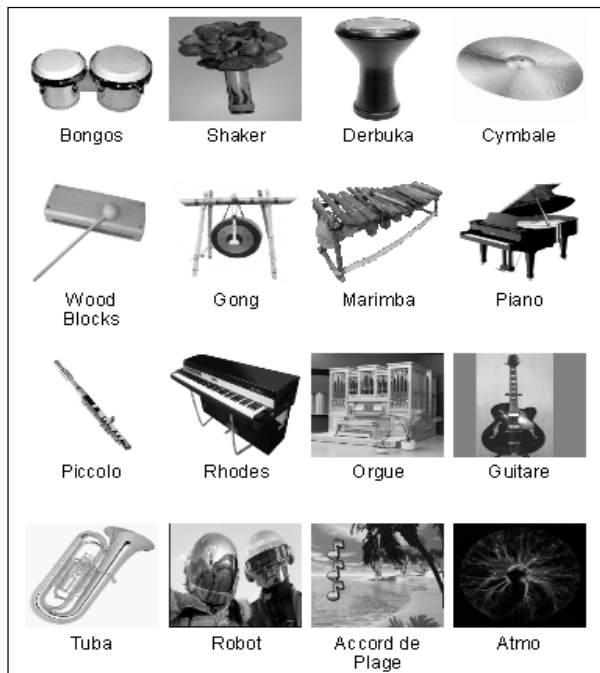
Figure 3. MIDI page of the instrument booklet

Unlike the first experiment, our system is given the exact same status as the usual instruments. This way we could see whether the children would still use the Wiimote system or revert to the standard instruments. Also, restricting the patients to only one instrument prevents them from being overwhelmed by the excitement induced by too large a choice.