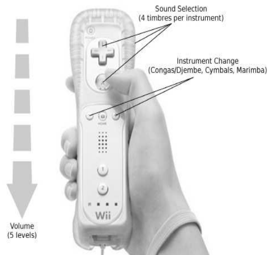
Figure 2. MAWii UI for sound generation (2 Wiimotes/patient)

Obviously, one of the great advantages of the Wiimote is that it can be used to control any synthesizable sound. Therefore, instead of having just one instrument each, we gave the children the possibility to have as many instruments as they would like.