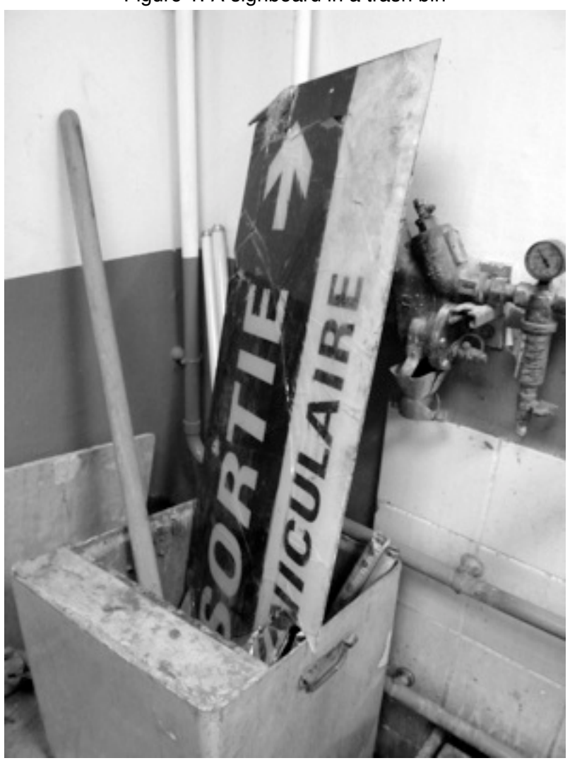
Figure 1. A signboard in a trash bin

(2003), Bennet (2004), Orlikowski (2007), Law (2010), Suchman (2011), treat the material dimension of society and the place occupied by matter in our everyday lives. We will show why it is productive to consider the material aspects of social order, all the while refusing to reduce matter to properties such as solidity and durability. Fragility is a mode of existence of matter that must be considered if material ordering processes are to be documented in their full complexity.