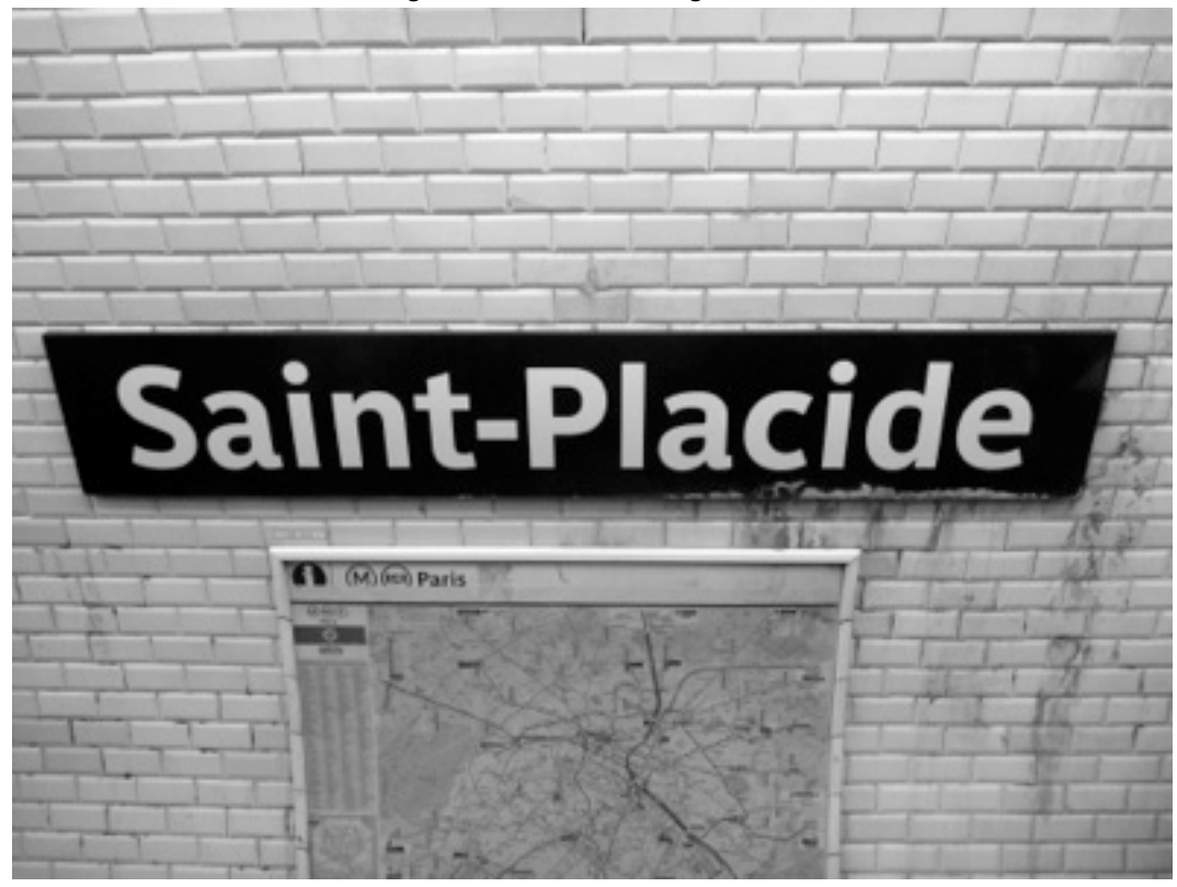
Figure 4. Mold on a signboard

We were also confronted with the fact that signboards could have a much more turbulent life than imagined initially. Far from being condemned to immobility, some of them do actually circulate and leave subway spaces. Indeed, subway signs can be coveted so much that sometimes they get stolen (by collectors, resellers, or simply by people who want to decorate their apartment). Such a disappearance marks a transition in the life of signboards (Thompson 1979), which become commodities and enter "into the sphere of circulation and exchange" (Engestrom and Blackler 2005, 319). And this is a transition that represents a significant danger for a wayfinding system that relies on the omnipresence of signs.