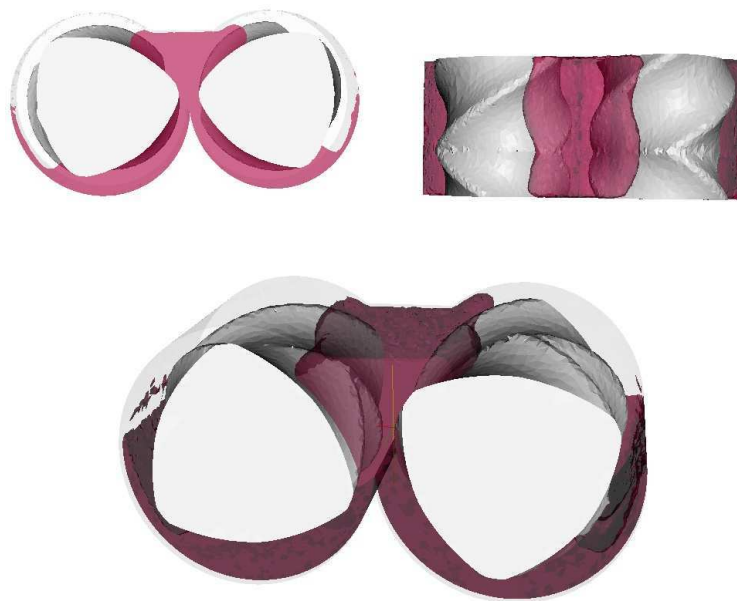
Figure 2: Free surface position in a batch mixer.