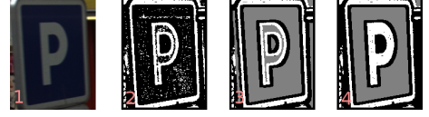
Fig. 3. From left to right: 1. Original image, 2. Binarization (function s from eq. 6), 3. Homogeneity constraint (eq. 7), 4. Filling in small homogeneous regions.

Then, no boundaries will be extracted from homogeneous areas. s is a segmentation of f (notice that now we have 3 possible values instead of 2: a low value, a high value and a value that represents homogeneous regions).