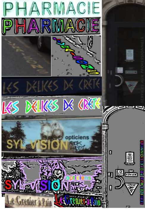
Fig. 4. Six results of our method on various texts from IGN [10] image database. Segmentation is difficult as there is a wide variety of text: text style, illumination and orientation may vary. Decorations (illustrated background, relief effect on characters...) may decrease readability.