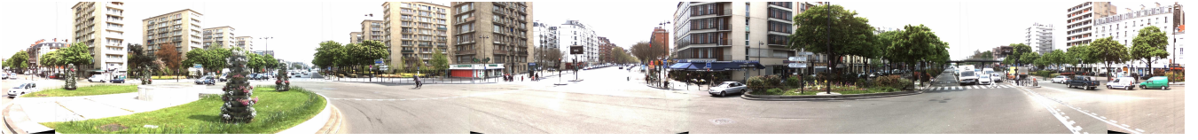
Fig. 5. Image from the itowns project.