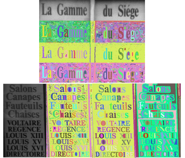
Fig. 6. Results of various algorithms on different images. From top to bottom and left to right: Original image, Niblack thresholding, Sauvola thresholding and our method. More characters are segmented with our method.

Before processing the comparison, each method is set up. Different sets of parameters have been used for each method. The parameters leading to the best result (in terms of segmentation quality) are selected for each method and all comparisons are performed using selected parameters. For all methods we select the size of the mask 9x9. k parameter is set to -0.05 and 0.05 for Niblack (eq. 1) and Sauvola (eq. 2) criterion respectively. For our method, the lowest contrast ( c_{min} in eq. 7) is set to 16 and p parameter (eq. 7) is set to 80%. Results of all methods can be seen in figure 6.