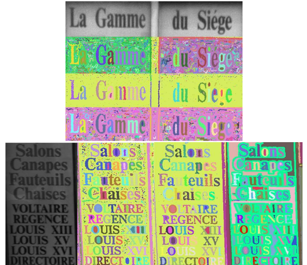
Fig. 6. Results of various algorithms on different images. From top to bottom and left to right: Original image, Niblack thresholding, Sauvola thresholding and our method. More characters are segmented with our method.

Before processing the comparison, each method is set up. Different sets of parameters have been used for each method. The parameters leading to the best result (in terms of segmentation quality) are selected for each method and all comparisons are performed using selected parameters. For all methods we select the size of the mask 9 \times 9 . k parameter is set to -0.05 and 0.05 for Niblack (eq. 1) and Sauvola (eq. 2) criterion respectively. For our method, the lowest contrast ( c_{min} in eq. 7) is set to 16 and p parameter (eq. 7) is set to 80%. Results of all methods can be seen in figure 6.