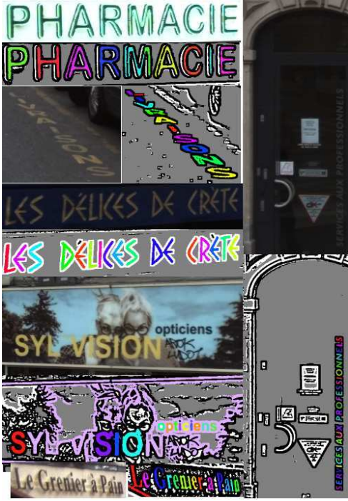
Fig. 4. Six results of our method on various texts from IGN [10] image database. Segmentation is difficult as there is a wide variety of text: text style, illumination and orientation may vary. Decorations (illustrated background, relief effect on characters...) may decrease readability.