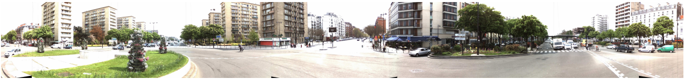
Fig. 5. Image from the itowns project.