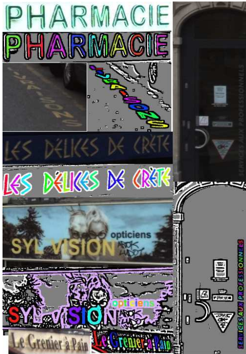
Fig. 4. Six results of our method on various texts from IGN [10] image database. Segmentation is difficult as there is a wide variety of text: text style, illumination and orientation may vary. Decorations (illustrated background, relief effect on characters...) may decrease readability.