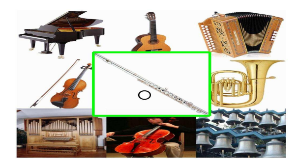
Fig. 1. Instrument choice screen

Interestingly, this feature is at the opposite of what is usually considered as a key gameplay asset in traditional video games; the challenge here is to shrink the choice space while keeping the fun factor as high as possible.