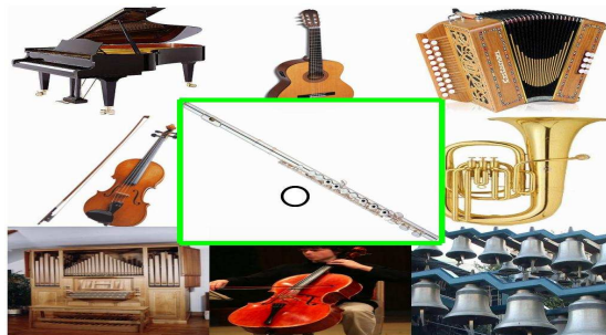
Fig. 1. Instrument choice screen

Interestingly, this feature is at the opposite of what is usually considered as a key gameplay asset in traditional video games; the challenge here is to shrink the choice space while keeping the fun factor as high as possible.