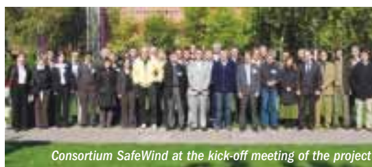
Consortium SafeWind at the kick-off meeting of the project

By the end of 2006, the System and Market Operator of Australia AEMO (ex NEMMCO) launched an international call for a prediction system for all wind farms participating in the Australian market. This project (ANEMOS@OZ) was won by the ANEMOS consortium (a sub-group of six partners). The ANEMOS platform was adapted for the Australian conditions and was installed in Australia in September 2008. Since then, it operates online with very good performances in terms of accuracy and reliability of service. It provides predictions for five minutes ahead up to two years, which are used