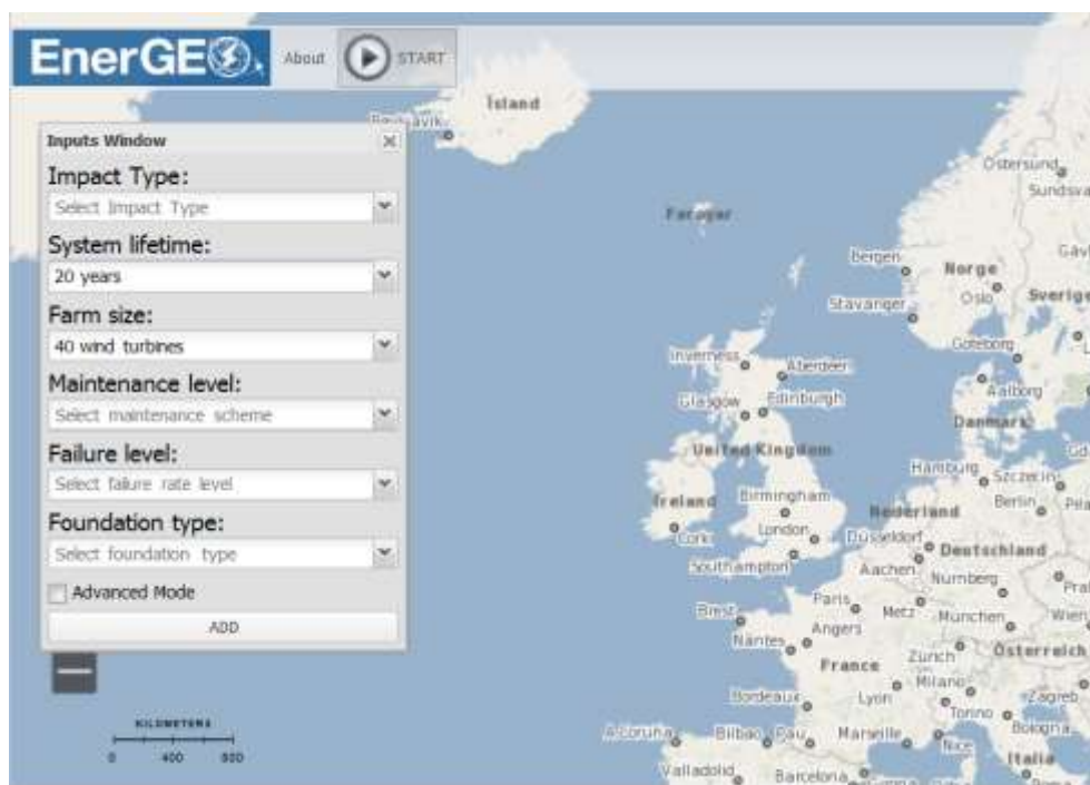
Figure 3 Screenshot of the developed web map service for EnerGEO

Once these parameters are selected, a resulting map is displayed with a legend corresponding to the impact category chosen. Any user can therefore compare the environmental performances of different configurations by changing the input key parameters. When clicking on a specific site of the map, the numerical value of the resulting environmental performance appears.