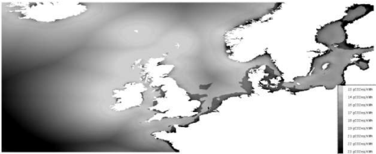
Figure 2 Impact on climate change per kWh generated at the high voltage grid

Figure 2 shows that environmental performances range from 13 to 23 g CO 2 eq/kWh of electricity produced at the high-voltage grid. These values confirm the overall good performances of offshore wind farms in North Sea. The high performances observed far from the European coasts highlight the advantage of wind farms development where wind distribution are more favorable. Irregularities in the costal performances come from two phenomenon: 1- wind distributions at hub height could be locally less favorable to electricity generation; 2- the environmental impact of the selected fixed wind turbines, which is assumed to be settled near to coasts, are bigger than those of the floating structures (mainly because of steel required for the foundation)..