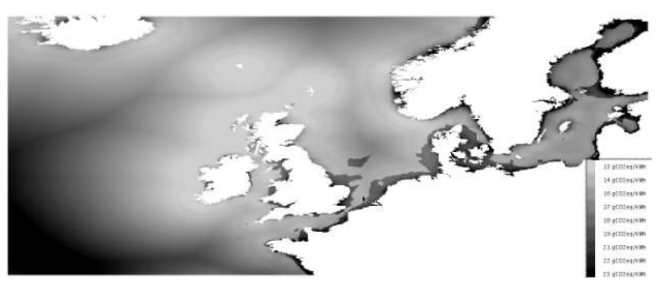
Figure 2 Impact on climate change per kWh generated at the high voltage grid

Figure 2 shows that environmental performances range from 13 to 23 g CO_2 eq/kWh of electricity produced at the high-voltage grid. These values confirm the overall good performances of offshore wind farms in North Sea. The high performances observed far from the European coasts highlight the advantage of wind farms development where wind distribution are more favorable. Irregularities in the costal performances come from two phenomenon: 1- wind distributions at hub height could be locally less favorable to electricity generation; 2- the environmental impact of the selected fixed wind turbines, which is assumed to be settled near to coasts, are bigger than those of the floating structures (mainly because of steel required for the foundation)..