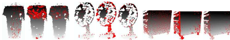
Fig. 3. Detected keypoints on trash can, fan and storage cupboard models with: SID in first column, SC_HK in second column and SC_HK_connex in third column.

To evaluate detector performance, we illustrate a visual comparison of keypoint positions detected with SC_HK, SC_HK_connex, and SID detectors as shown on figure 3. It reveals that the final selected points are quite well localized. The combining process allows a better feature point filtering than SC or HK alone, as false detected points in both are eliminated, and points with correct surface type remain. Figure 4 illustrates the relative stability of keypoint’s positions detected with SC_HK_connex detector when varying viewpoints for the same object. Clearly, we recover almost same keypoint positions in the different views. For a quantitative analysis showing the superior repeatability of our keypoints, we refer the reader to our previous publication [13].