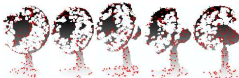
Fig. 4. Detected keypoint on fan model with SC_HK_connex, in view angle variation